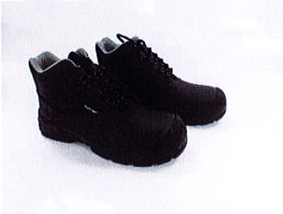
Footwear described as Rhodium RF250